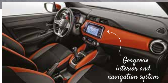
Gorgeous interior and navigation system

Think night and day. Think chalk and cheese. This is what the new Nissan Micra is to the out-going Micra.