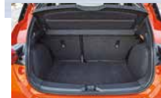
Loads of boot space

car back on course, should it be needed. Nissan's Intelligent Around View Monitor camera set-up, already in use on the Qashqai and Juke, is also included on the Micra. The car packs an awesome BOSE Personal audio system, and there's also a 7in infotainment system, positioned high in the middle of the dashboard, where you can access radio channels, music tracks and satnav.