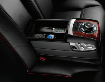
By Tim Barnes-Clay, Motoring Journalist. Follow Tim on Twitter @carwriteups or visit www.carwriteups.co.uk

Inside, electronically adjustable thigh supports for the front passenger complement a fresh seat structure, enhancing the Ghost's unchallenged luxury levels. Furthermore; the rear seat design ensures absolute wellbeing if you want to conduct business or simply relax. In 'lounge seat' configuration, the natural grain leather chairs are angled towards each other to create a more intimate setting, allowing you and your passengers to converse more easily.